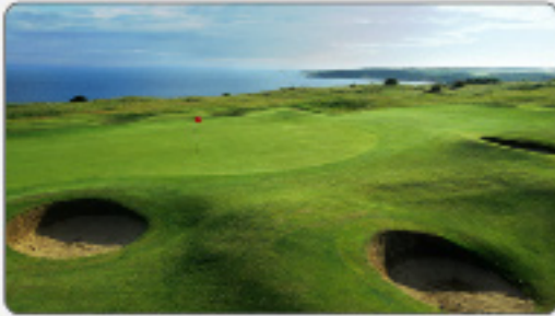
GULLANE NO. 1, 9TH HOLE

The Club is a private Members' Club that welcomes visitors to play its courses.